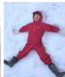
Fun in the snow