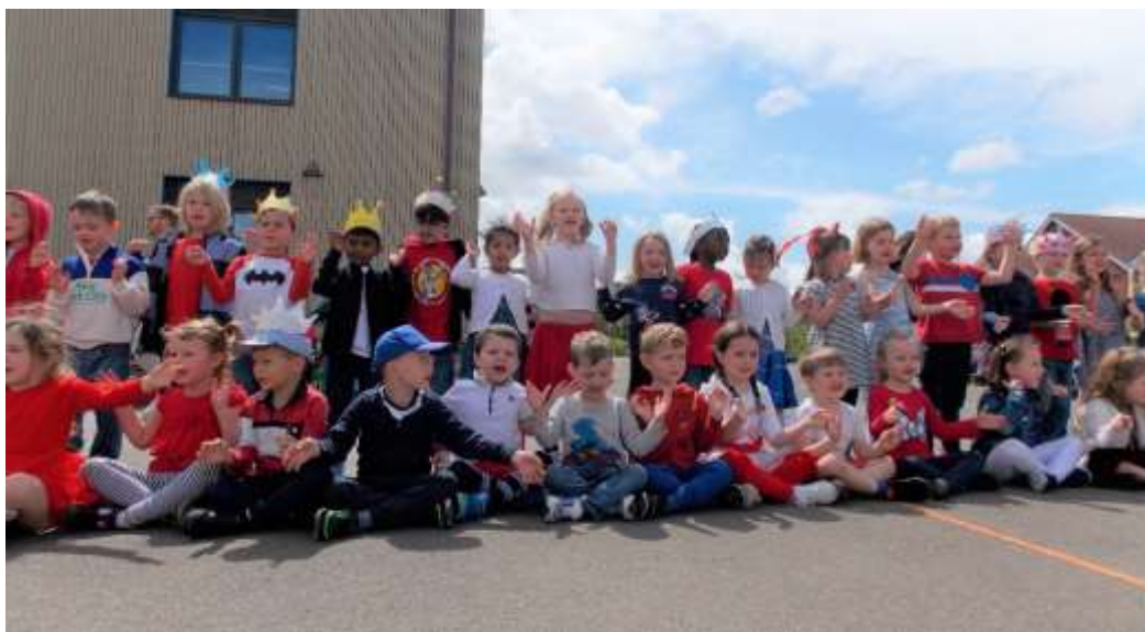
Badgers and Squirrels EYFS classes singing at the Coronation picnic, 5 th May 2023

We are delighted you have chosen to be part of our school community – we are a large school but have a distinctly warm and welcoming family feel which will ensure you and your child will settle in quickly and make new friends.