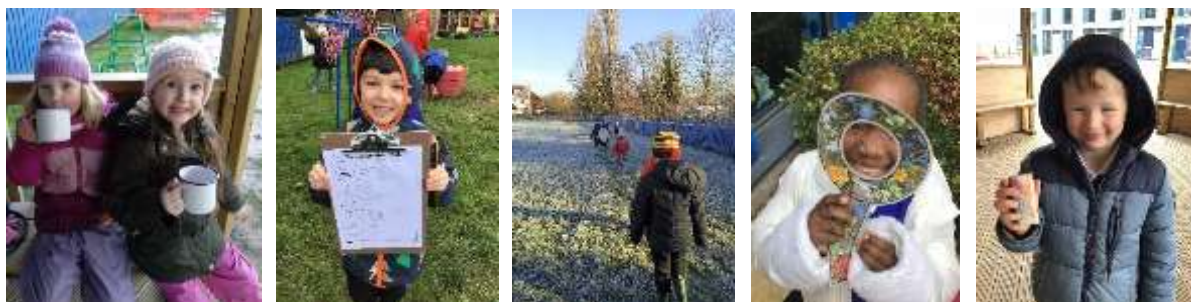
EYFS (Early Years Foundation Stage) Outdoor Learning