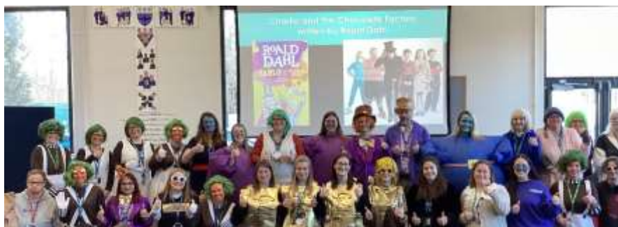
Our staff teaching team, World Book Day 2023

We are delighted you have chosen to be part of our school community – we are a large school but have a distinctly warm and welcoming family feel which will ensure you and your child will settle in quickly and make new friends.