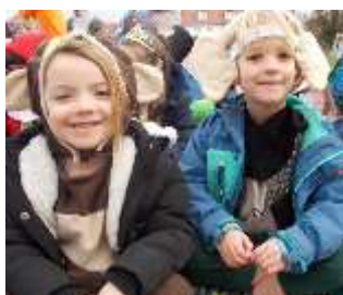
World Book Week dressing up; reading in the library on pyjama day!