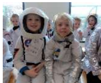
Space Day for EYFS