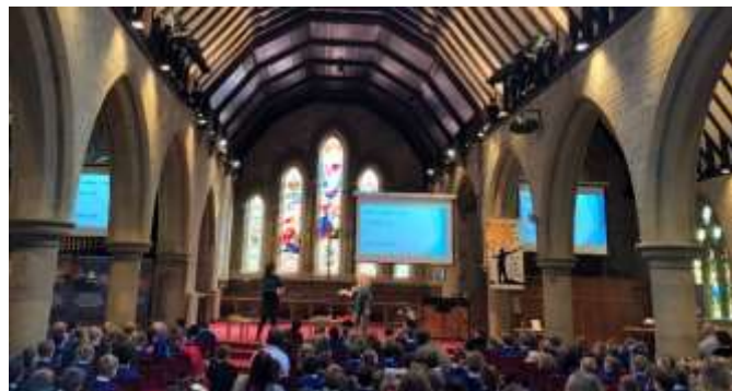
Easter service at St Stephen's church, Tonbridge